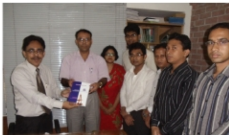
Acting VC receiving UAP Journal of Law, Vol 2, No.1, from Dept. Head, L&HR

Department of Law and Human Rights, University of Asia Pacific published the 2nd volume of 'UAP Journal of Law' on June 27, 2011: